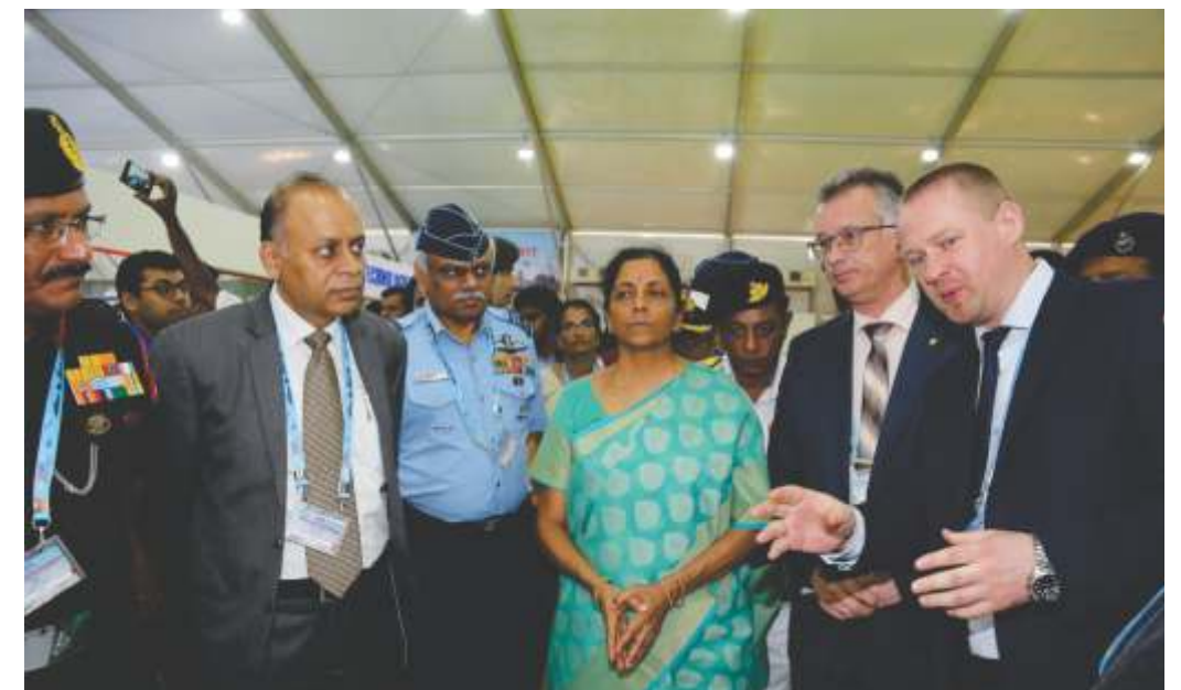
Hon'ble RM being briefed by foreign OEM