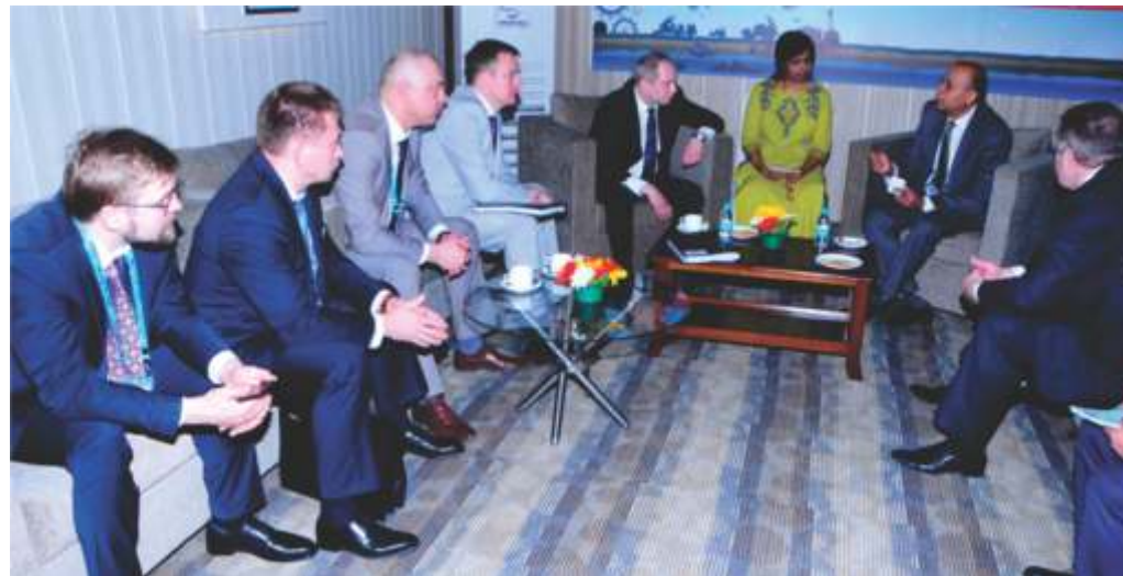
Bilateral meeting prior to MIC Seminar