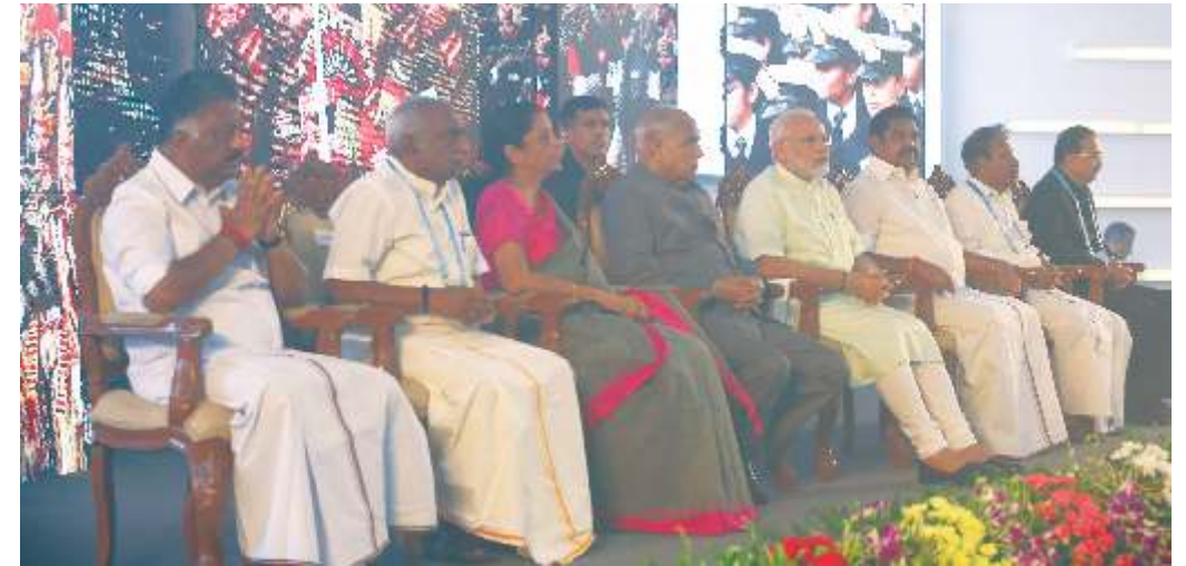
August presence of Hon'ble PM, Hon'ble Governor of Tamil Nadu, Hon'ble RM, Hon'ble CM of Tamil Nadu, Hon'ble Dy CM of Tamil Nadu, Hon'ble RRM and other Dignitaries at the Inaugural event