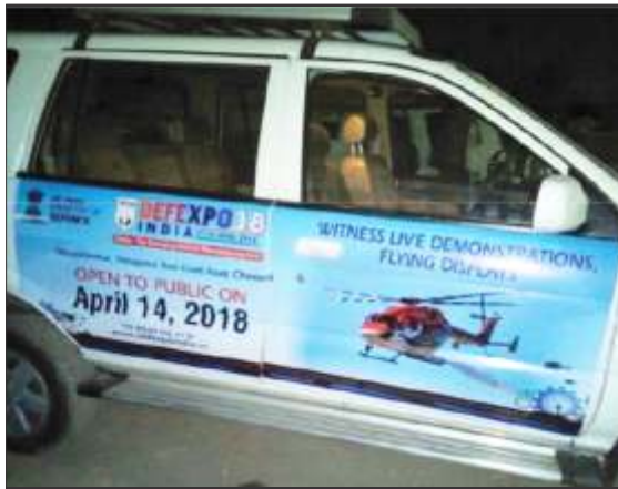
Event branding on Chennai Taxi