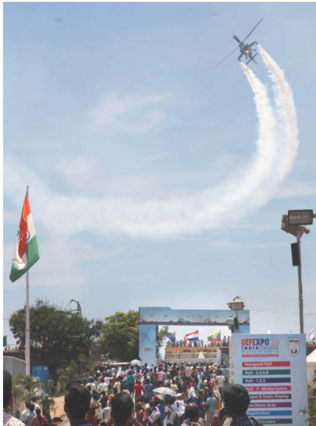
Air show on April 14, 2018

DefExpo 2018 was widely publicized by erecting outdoor hoardings in Chennai and other Metros, translights were displayed at various Airports. A comprehensive media plan was implemented across print, FM radio, television, outdoor (hoardings, auto/taxis/bus, cinema hall) and social media platforms in a phased manner.