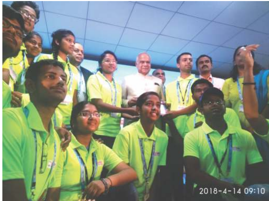
Certificate distribution to students volunteers