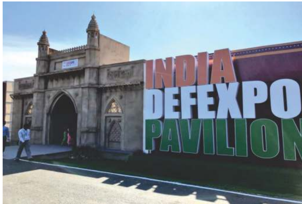
The India Pavilion