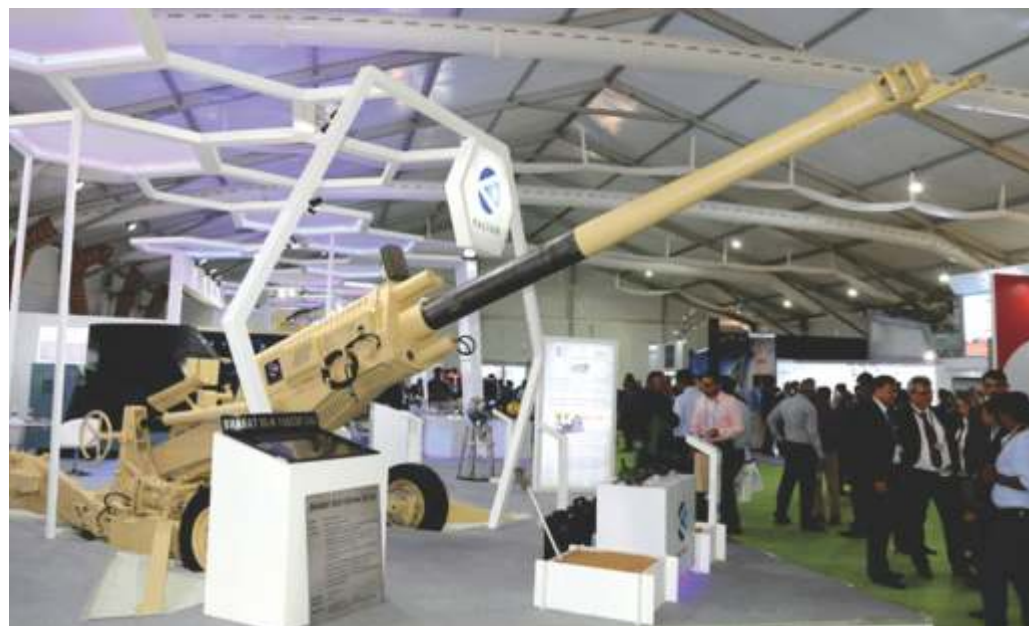
Indian Private Industry Products on Display