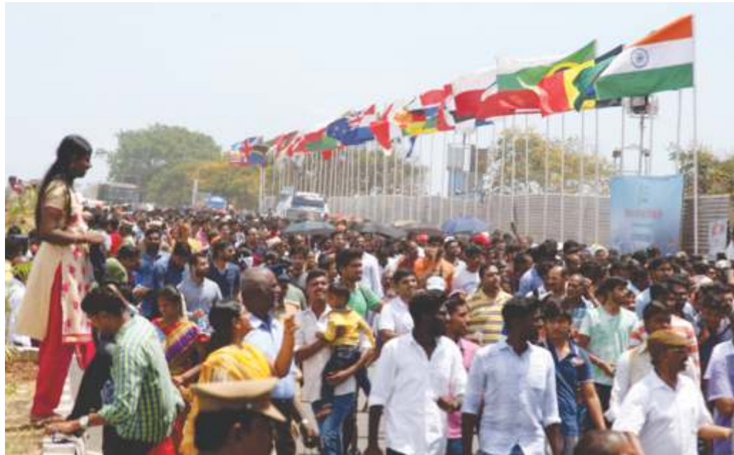
General Public visiting DefExpo on April 14, 2018