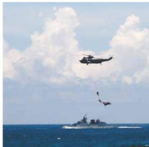
Marine Commandoes at High seas