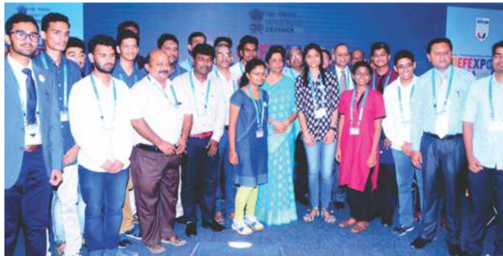
Prize winners with Hon'ble Raksha Mantri