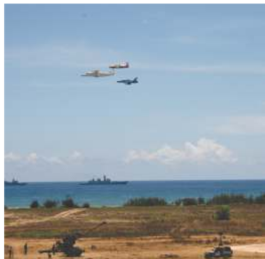
Indigenous Aircrafts Flying Past