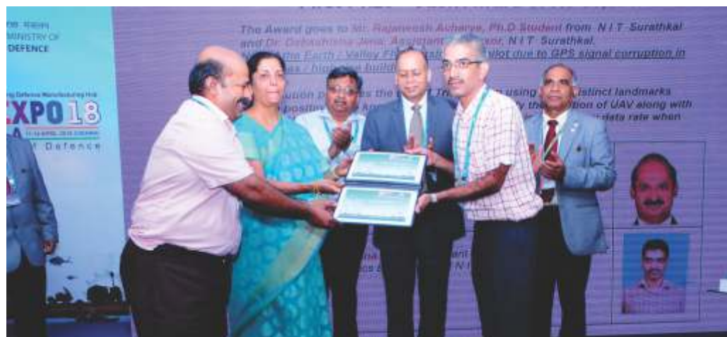
First Prize Winners