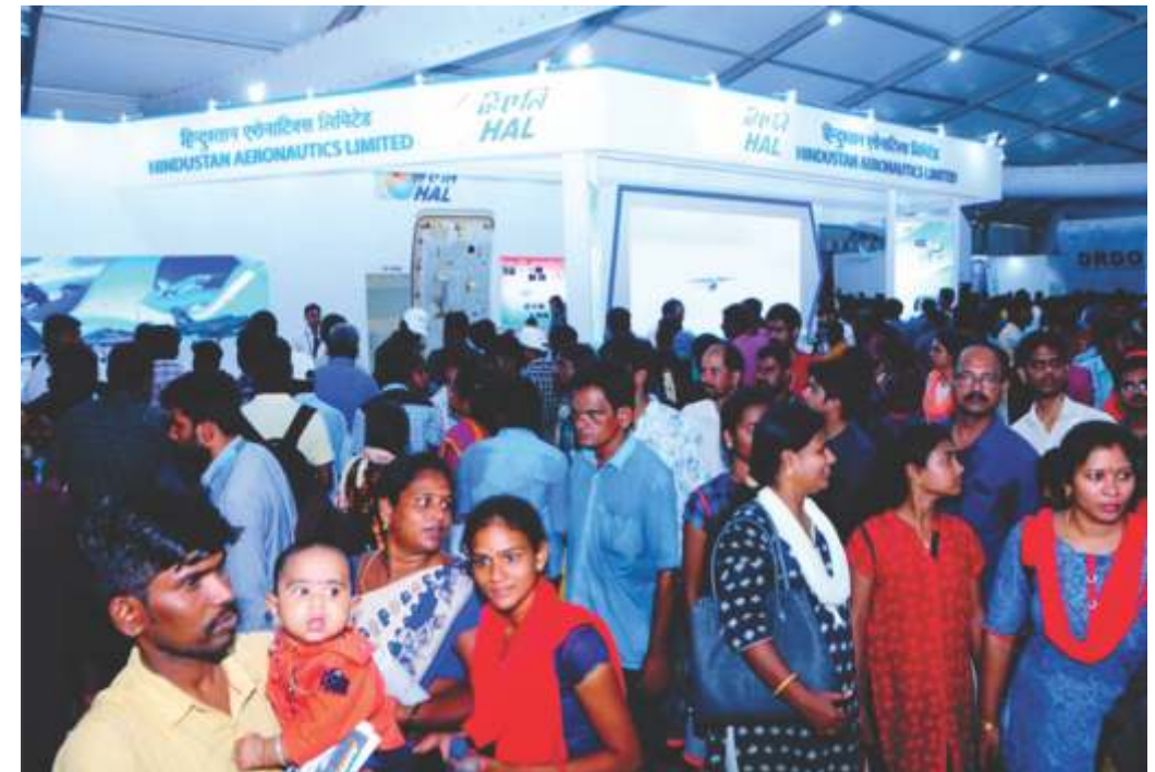
Public at Display Stall