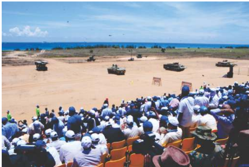
Public witnessing live demonstrations