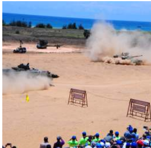
Land systems Demonstration