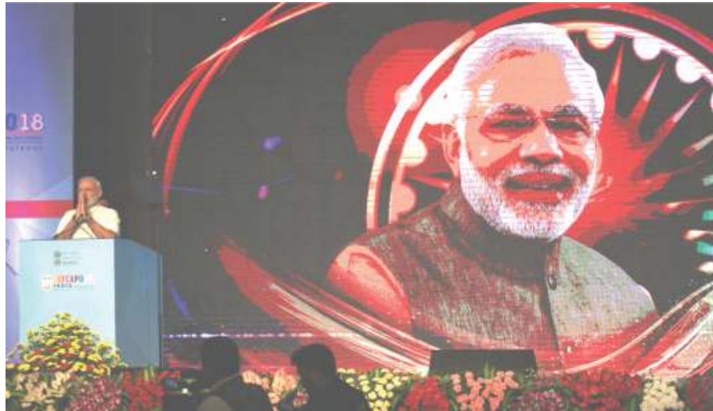
Hon'ble PM Inaugurating the event