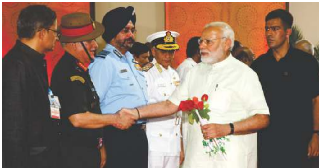
Hon'ble PM's arrival at venue

Purohit, Hon'ble Raksha Mantri Smt Nirmala Sitharaman, Hon'ble Chief Minister of Tamil Nadu Shri Edappadi K. Palaniswami, Hon'ble Deputy Chief Minister of Tamil Nadu Shri O. Panneerselvam, Hon'ble Raksha Rajya Mantri Dr. Subhash Ramrao Bhamre among many others. Several Central and State Ministers, Ministers and Ambassadors from various participating countries also were present.