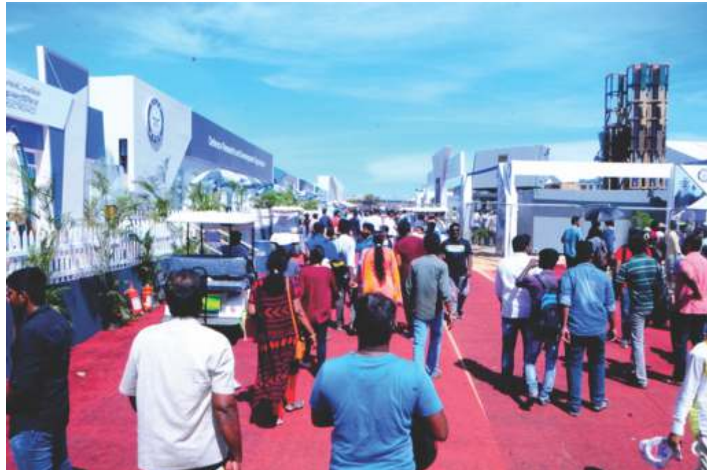
General Public at DefExpo