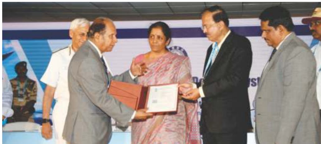
Hon'ble RRM handing over DRDO Technology