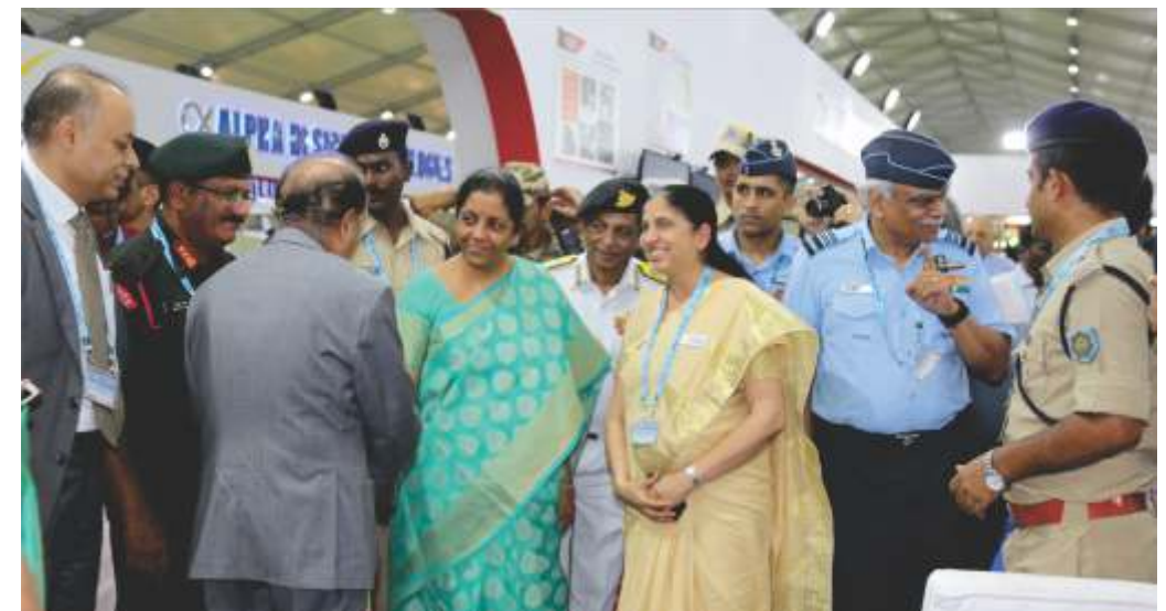
Hon'ble RM interacting with exhibitors