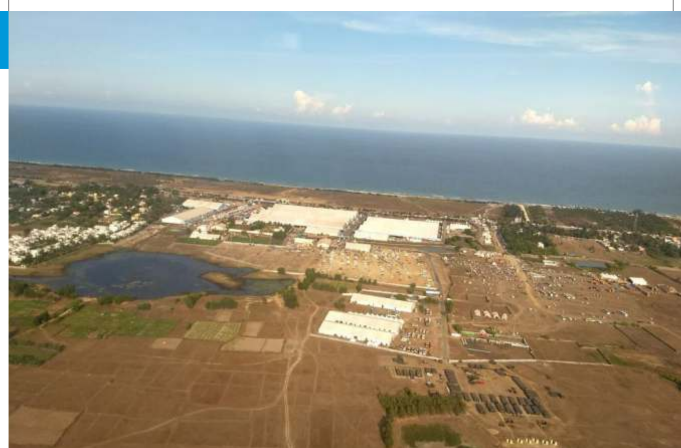
DefExpo venue by day and night