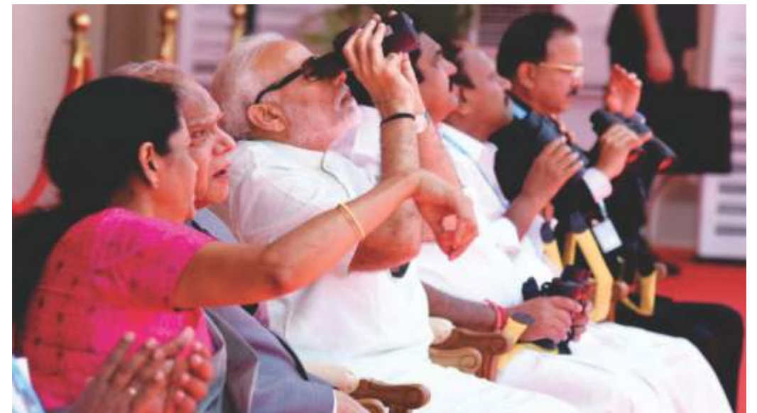
Hon'ble PM witnessing live demonstration