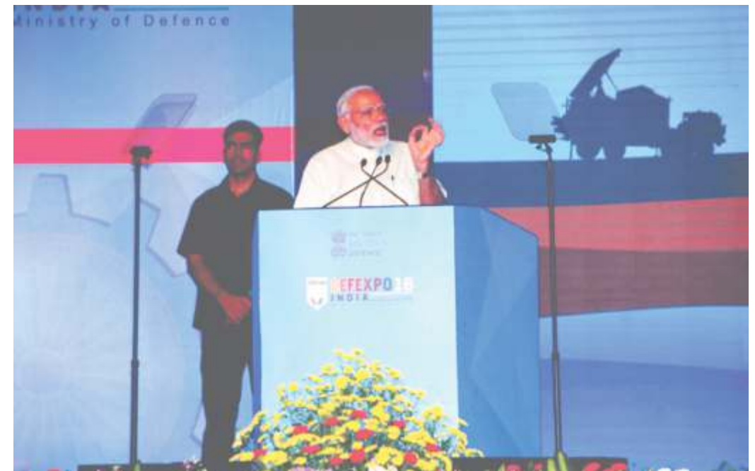
Hon'ble Prime Minister delivering Inaugural Speech