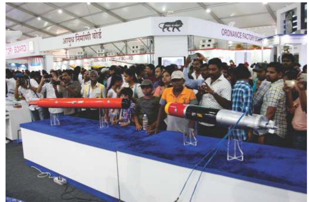
Public viewing models at BDL Stall