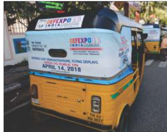
Event branding on Chennai Auto rickshaw