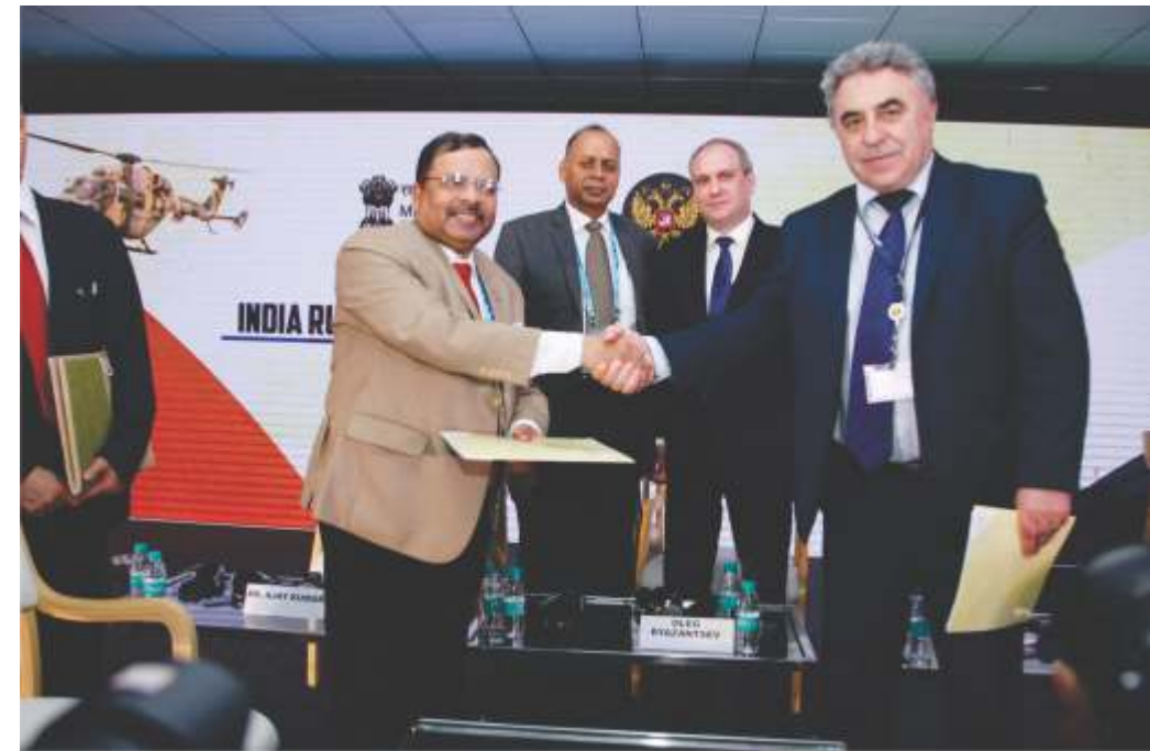
Signing of MoU : India Russia Military Industrial Conference