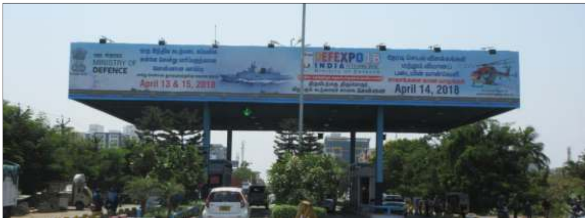
ECR Toll Plaza