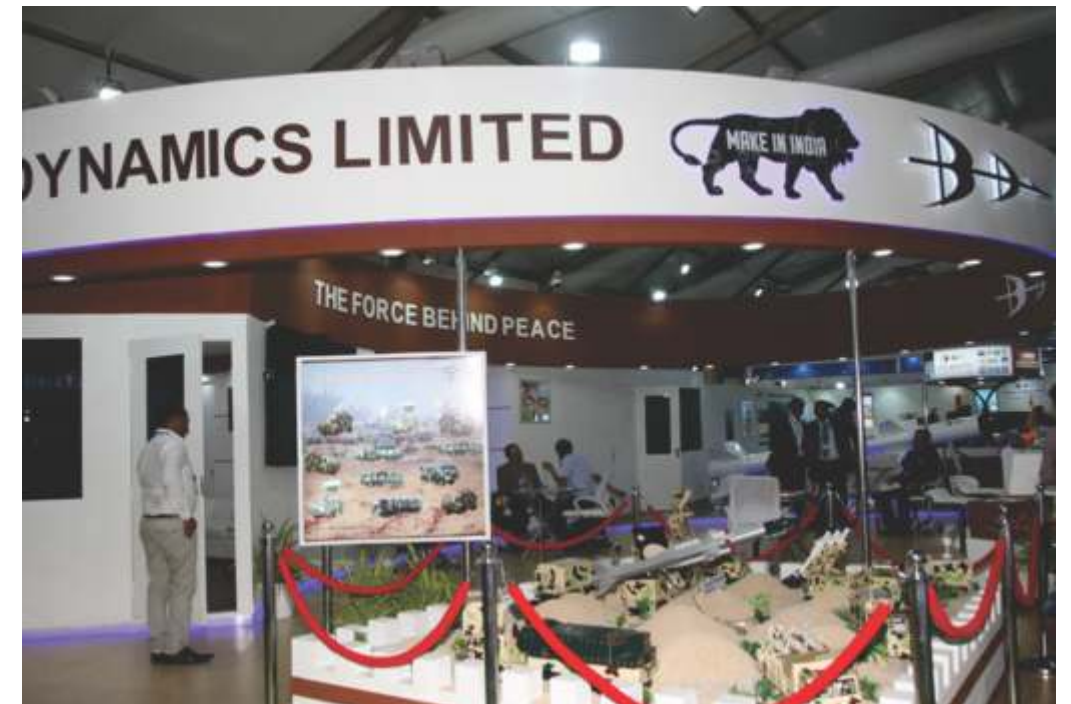
Public Sector Exhibits