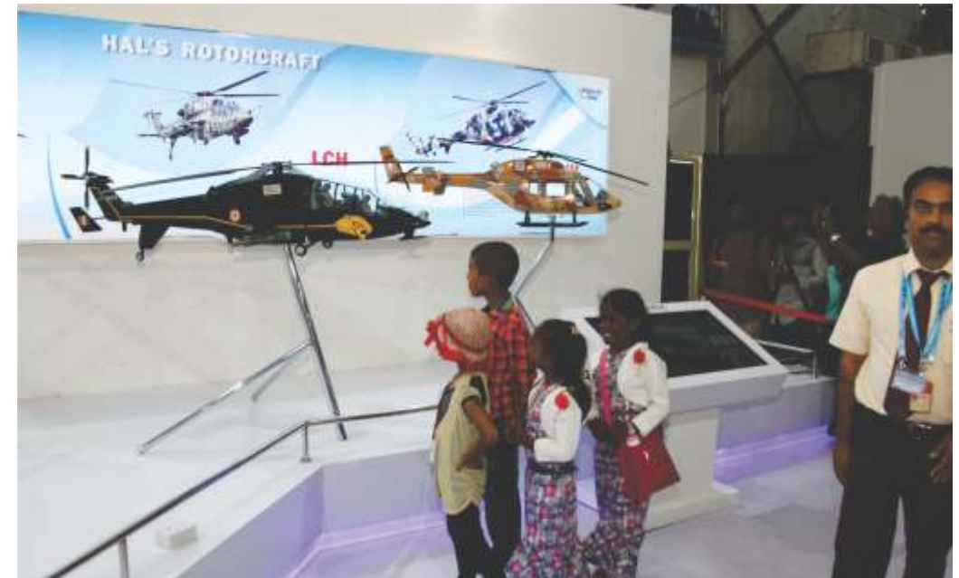
Children enjoying at HAL Stall