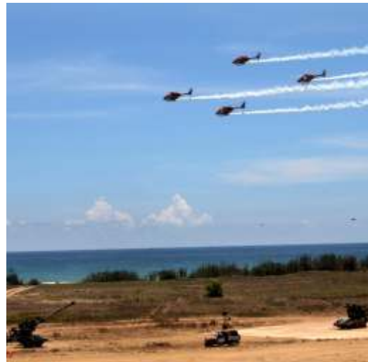
Flying Display by Team SARANG